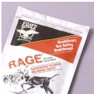
VF-48 white foil material for both pictures

Zipper bag Two styles tamper evident or Non tamper evident bags. Tamper evident bags have an inch of header on the outside of the zipper; zipper is hermetically sealed. Product is loaded through the unsealed bottom of the bag. Non tamper evident bags are loaded through the zipper. OD dimensions include this header. For zippered bags there are 3/8" side seals. Opening of bag can also have 1/8" lip. Minimum quantities are 5,000 for unprinted, 10,000 for printed. Smaller quantities will be quoted for large bags.